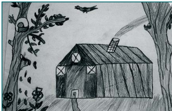
Drawing by a child detainee in Port Hedland

The second concern is that the absence of the right to family reunion for the duration of the visa, combined with the effective ban on overseas travel, means that some children may be separated from their parents or family for a long, potentially indefinite, period of time. Again, this can undermine a child's mental health and well-being, especially for unaccompanied children who may want to try to see their family.