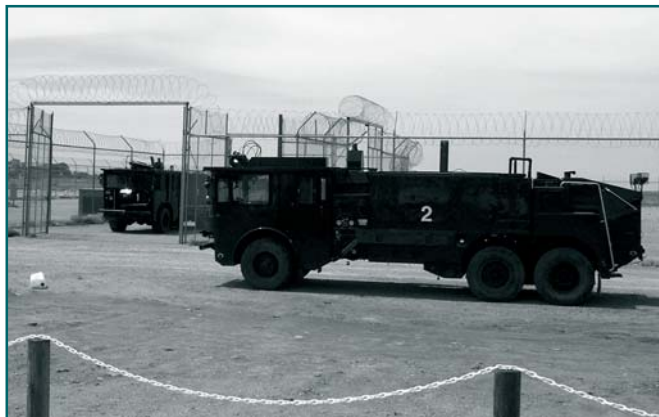
Blue fire trucks sitting outside Woomera, June 2002

Even when families were able to move to a safer compound, children were not always protected from the psychological impact of the riots, either because the disturbances occurred in all the compounds or because children were frightened by what they could still see and hear going on nearby.