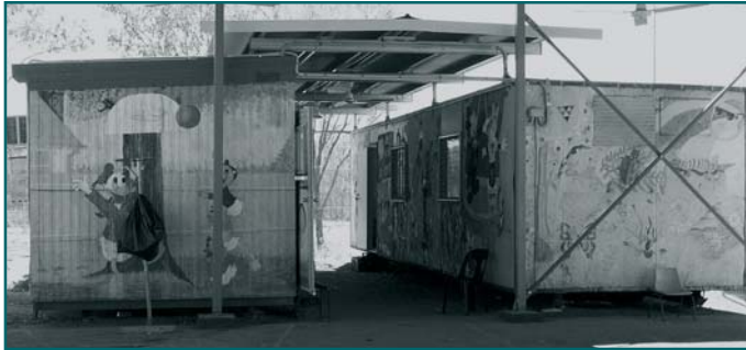
School education buildings and recreation area at Curtin, June 2002