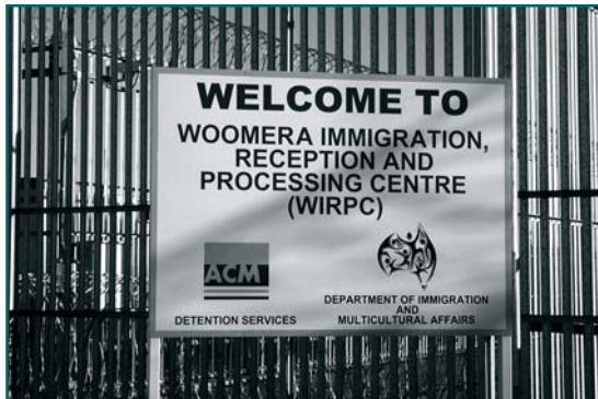
Sign outside Woomera indicating ACM and the Department, June 2002

The highest number of children in detention at any one time between 1 January 1999 and 1 January 2004 was 842 (on 1 September 2001). Of this number, 456 were at the Woomera detention centre.