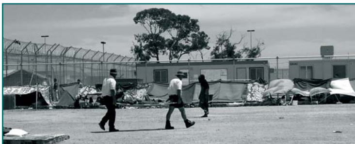
Hunger strike at Woomera, January 2002