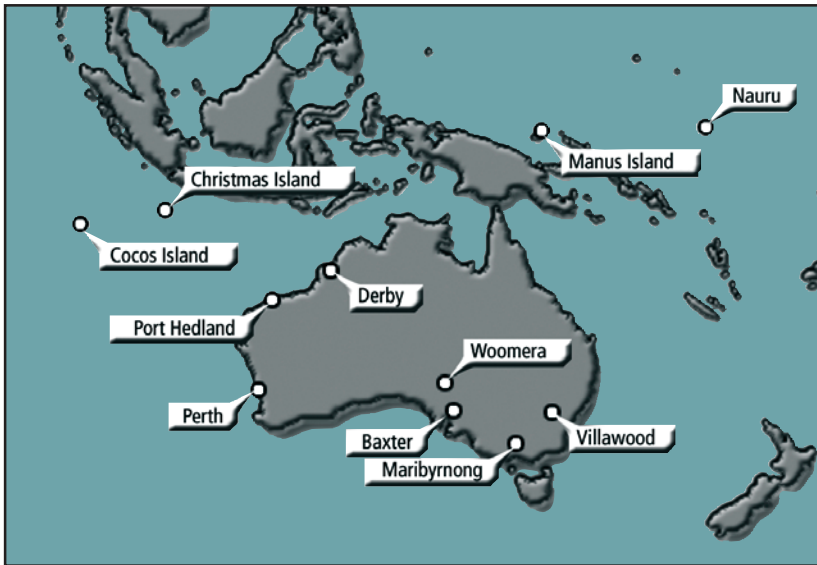
Locations of detention centres in and around Australia

Residential housing projects were opened in Port Hedland and Port Augusta (near Baxter) after the period of the Inquiry.