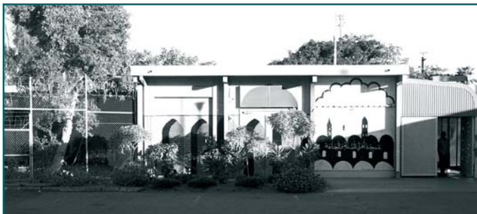
Muslim prayer room at Port Hedland, June 2002

There are conflicting groups forced into close proximity with each other that leads to tensions ... Religious tensions that may have caused people to flee in the first place are part of everyday life in the detention centres.