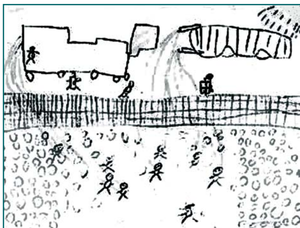
Drawing of water cannons at Woomera by a child in immigration detention

The use of tear gas and water cannons and the sight of detention staff dressed in 'riot gear' caused particular distress to children. These experiences featured in drawings that detainee children presented to the Inquiry.