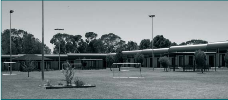
Family compound at Baxter, December 2002