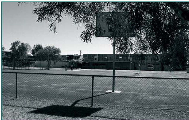
St Cecilia's Catholic school attended by children in Port Hedland, June 2002