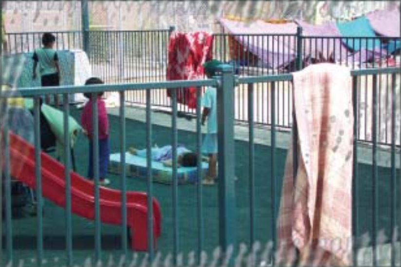
Children in playground at Woomera with hunger strike in background, January 2002

This publication provides a summary of the important issues, findings and recommendations of the National Inquiry into Children in Immigration Detention. It is not an exhaustive account of all the information contained in the Inquiry report.